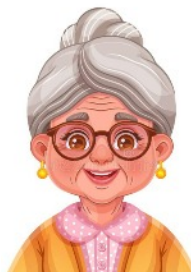
Events/Outings & Safeguarding Organiser Vacancy