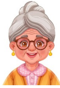
Events/Outings & Safeguarding Organiser Vacancy